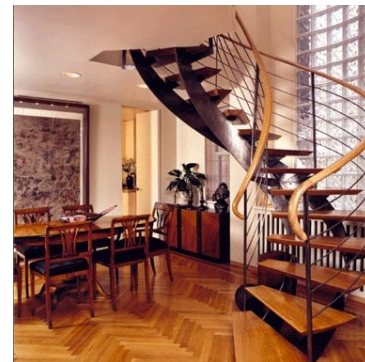
Caspi Residence - Custom Stair & Rail