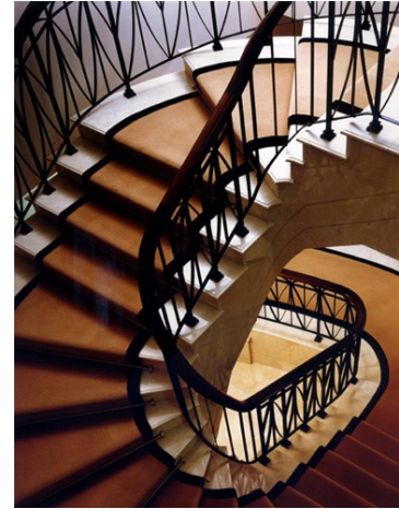
Mackay Sheilds - Custom Stair & Rail

http://www.PrecisionDraftingllc.com https://www.facebook.com/MiscIronDetailer